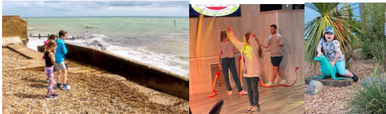
Church Farm sea gazing and circus skill