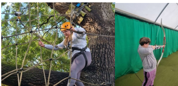
Devon Cliffs tree walking and archery